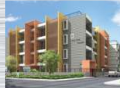
INLAND IMAAD Hegdenagar, Tanisandra, Bangalore