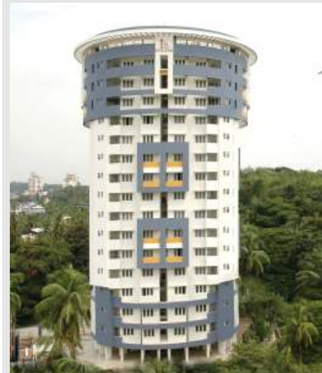
INLAND EBONY Kadri Main Road, Mangalore