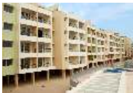
INLAND EVERGLADES Hebbal, Bangalore