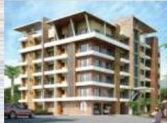
INLAND ELAN Matadakani Rd, Gandhinagar, Mangalore