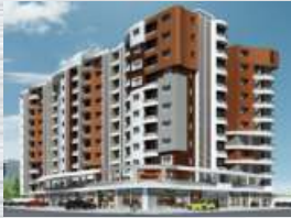
INLAND IMPALA Ullal, Mangalore