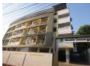
INLAND SOVEREIGN Mannagudda, Mangalore