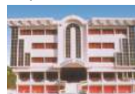
EMBASSY PLAZA Pumpwell, Mangalore