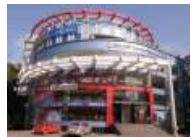
INLAND ORNATE (C) Navbharath Circle, Mangalore