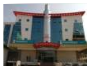
INLAND AVENUE (C) M. G. Road, Mangalore