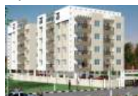
INLAND ENCORE Kadri Kambla Road, Mangalore