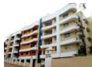
INLAND SALUTE Konchadi 4th Mile, Mangalore