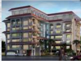
INLAND SCION Falnir, Mangalore