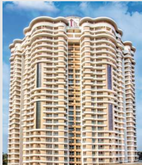
INLAND WINDSORS Maryhill, Airport Road, Mangalore