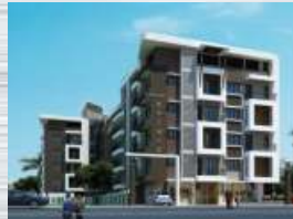
INLAND EVINCE Kadri Temple Road, Mangalore