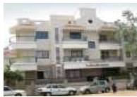
INLAND EXOTIC Benson Town, Bangalore