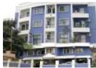
INLAND EMPRESS R. T. Nagar, Bangalore