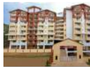
INLAND EON Matadakani Road, Mangalore