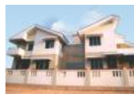
INLAND CLUSTERS Kottara Chowki, Mangalore