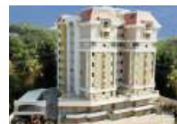
INLAND MONARCH Kadri, Mangalore