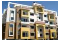
INLAND ELFIN Anand Nagar, Bangalore