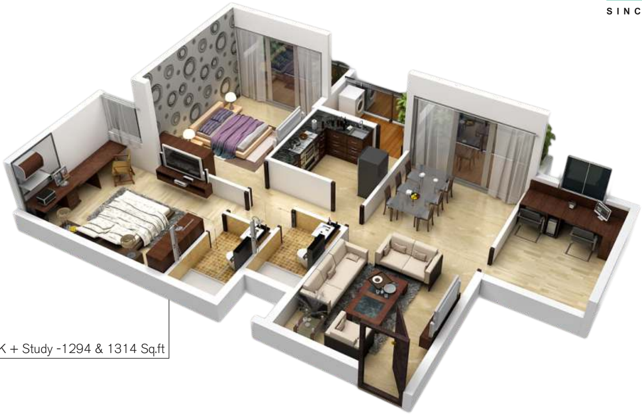
2BHK + Study -1294 & 1314 Sq.ft