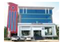
INLAND GALORE (C) Kankanady, Mangalore