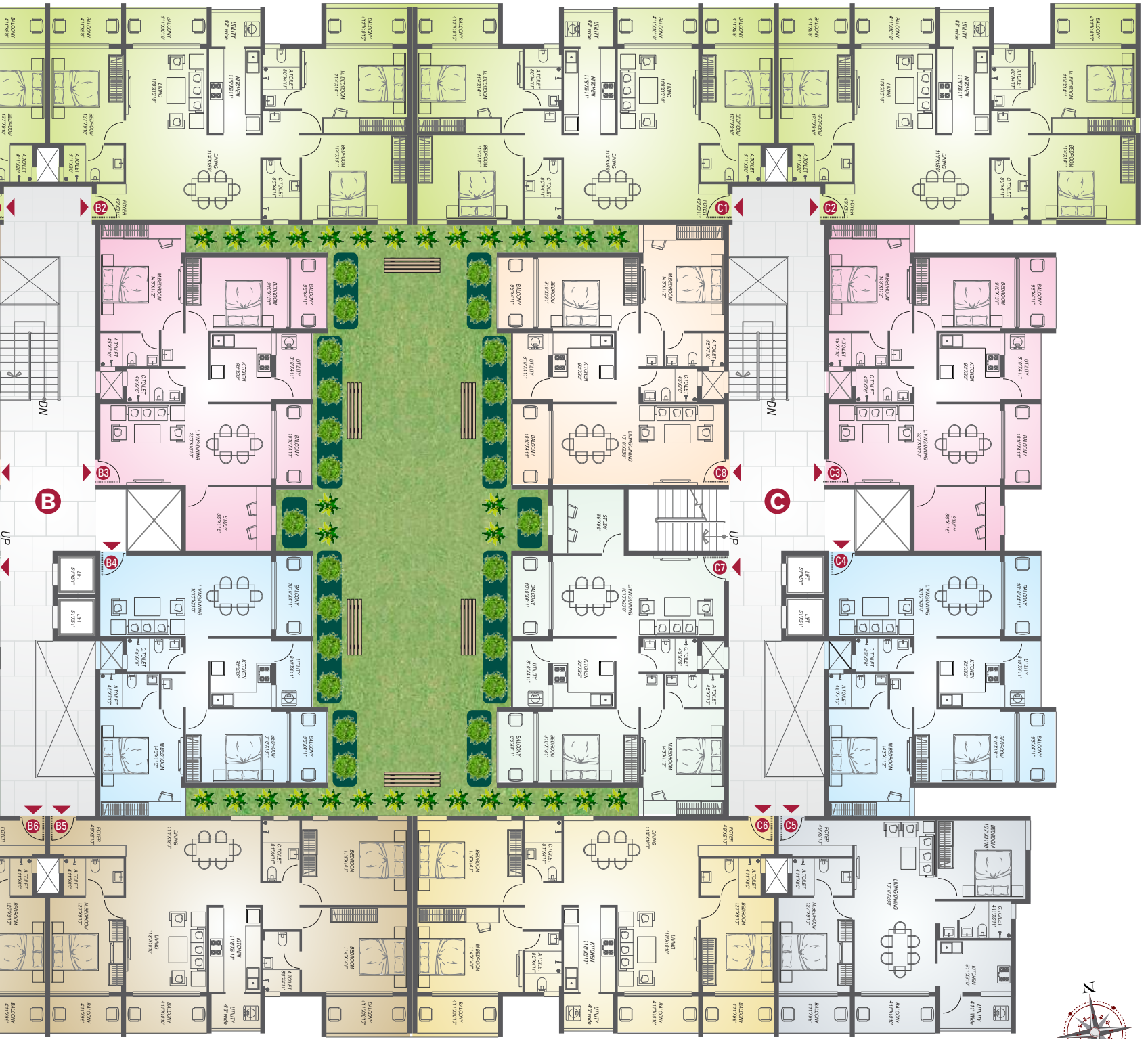
BLOCK - 'B'