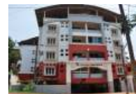
INLAND EMINENCE Kadri Temple Road, Mangalore