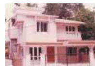
INDEPENDENT HOUSES Subhas Nagar, Mangalore