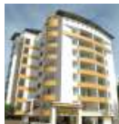
INLAND EXCELLENCY Arya Samaj Road, Mangalore