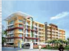
INLAND ESPANA Bejai (Near Church), Mangalore