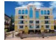
INLAND PRISTINE Kulshakar, Mangalore