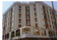
GOLDEN CHAMBERS Car Street, Mangalore