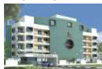
INLAND EVOKE Kankanady, Mangalore