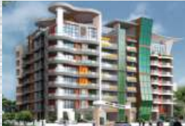
INLAND ECHELON Ballalbagh, Off M. G. Rd, Mangalore