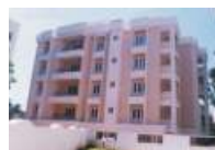
EMBASSY COURT Falnir, Mangalore