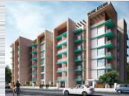
INLAND ESTORIA B. V. Road, Valencia, Mangalore