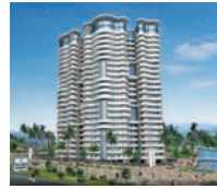
Inland Windsors (Res) Airport Road, Mary Hill, Mangalore