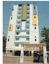
Inland Majestic (Res) Warehouse Road, Mannagudda, Mangalore