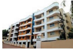
Inland Salute (Res) Konchadi 4th Mile, Mangalore