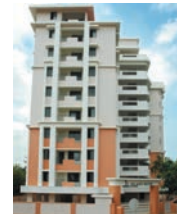
Inland Elite (Res) Near Navbharath Circle Kodialbail, Mangalore