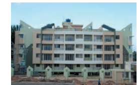
Inland Everglades, (Res) Hebbal, Kempapura, Bangalore