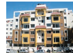
Inland Elfin (Res) Anand Nagar, Bangalore