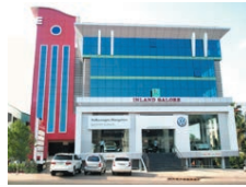
Inland Galore (Com) Kankanady, Mangalore