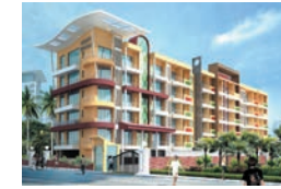
Inland Epsana (Res) Bejai New Road, Mangalore