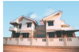
Inland Clusters (Res Villa) Kottara Chowki, Mangalore