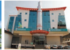
Inland Avenue (Com) M.G. Road, Mangalore