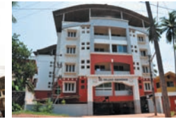
Inland Eminence (Res) Kadri New Road, Mangalore