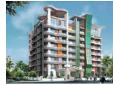
Inland Echelon (Res) Ballalbagh off M. G. Road, Mangalore