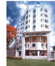
Inland Enclave (Res) Mannagudda, Mangalore