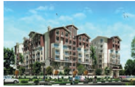
Inland Eon (Res) Matadakani Road, Gandhinagar, Mangalore