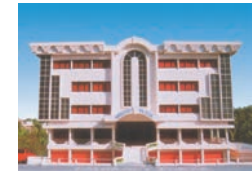
Embassy Plaza (Com) Pumpwell, Mangalore