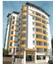
Inland Excellency (Res) Arya Samaj Road, Mangalore