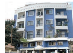
Inland Empress (Res) R.T. Nagar, Bangalore