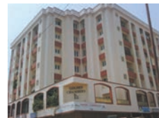
Golden Chambers (Com.Res) Carstreet, Mangalore