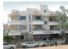
Inland Exotic (Res) Benson Town, Bangalore