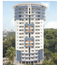
Inland Ebony (Res) Kadri Main Road, Mangalore