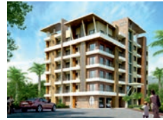
Inland Elan (Res) Matadakani Road, Gandhinagar, Mangalore