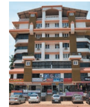
Inland Residency (Res) Valencia, Mangalore