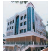
Sterling Chambers (Com) Kodialbail, Mangalore