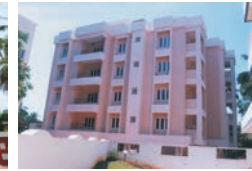
Embassy Court (Res) Falnir, Mangalore