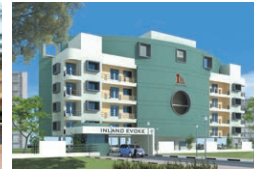
Inland Evoke (Res) Kankanady, Mangalore