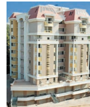
Inland Monarch (Com & Res) Near C.V. Nayak Hall Kadri Main Road