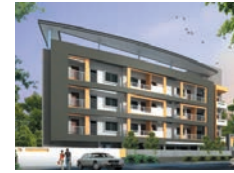
Inland Sovereign (Res) Mission Gori Road, Mangalore