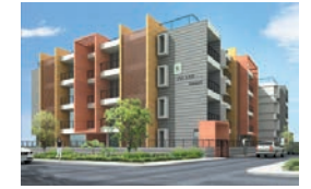
Inland Imaad (Res) Hegdenagar, Bangalore