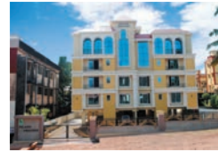
Inland Pristine (Res) Kulshekar, Mangalore