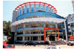
Inland Ornate (Com) Navbharath Circle, Mangalore