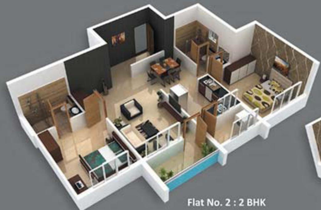
Flat No. 2 : 2 BHK 1210 Sq.Ft.