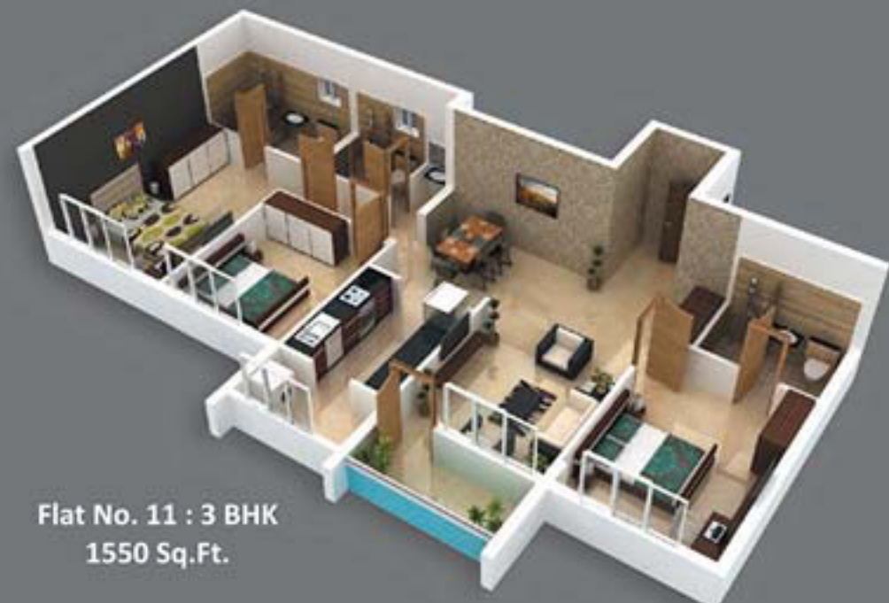
Flat No. 11 : 3 BHK 1550 Sq.Ft.