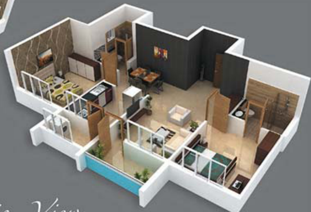
Flat No. 8 : 2 BHK 1190 Sq.Ft.