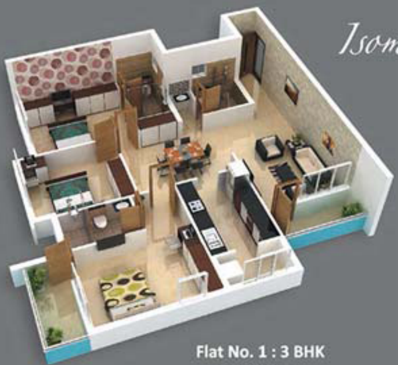
Flat No. 1 : 3 BHK 1595 Sq.Ft.